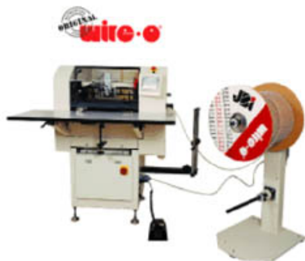
BB43 - High speed Wire-O® binding

DURABILITY AND POWER FOR FINISHING PROFESSIONALS